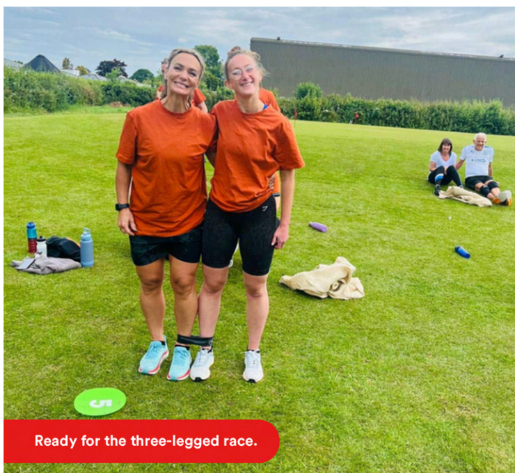
Ready for the three-legged race.

Sports Day came to Enderby Leisure and Golf Centre on 29 June, as 32 members and colleagues gathered in teams for the site's annual fundraiser. As ever the fun-filled event included traditional Sports Day races such as egg and spoon, and sack and three-legged races – raising a massive £465 for Dementia UK. Perennial favourites, Tug of War and welly wanging proved the most popular activities, with the Blue Team taking the overall win at the event once the scores were calculated.