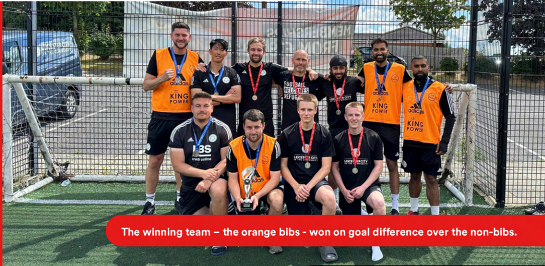
The winning team – the orange bibs - won on goal difference over the non-bibs.

Huncote Leisure Centre welcomed six teams for its Charity 5-A-Side Tournament on 7 July raising over £250 for Dementia UK - a massive achievement as unfortunately a couple of teams dropped out last minute. However, the tournament was still able to go-ahead with the six teams present, with the winners and runners-up both representing Leicester City in the Community.