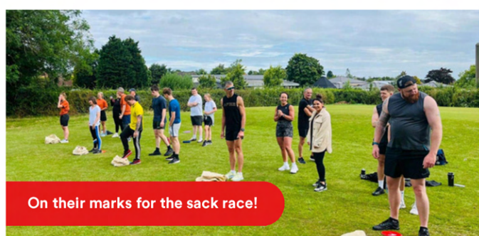
On their marks for the sack race!